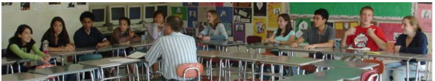
The Latin 1 students practice for ICL.

"It provides a whole new level of support and confidence for those of us playing, and shows not only