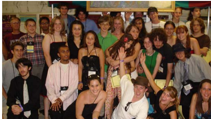
The Northside delegates pose after Fellowship. Exhausted by a week of contests and dances, the delegates still manage fantastic attitudes.

Even those who were up half the night were awake and running early each morning. Between the testing and certamen, Northside students had challenges ahead of them.